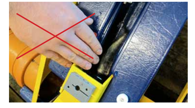
Never use your hands to remove fish from the automatic injector

If the whole dose has been injected the finger must be examined by a surgeon according to procedures described under "Automatic injection by machines"